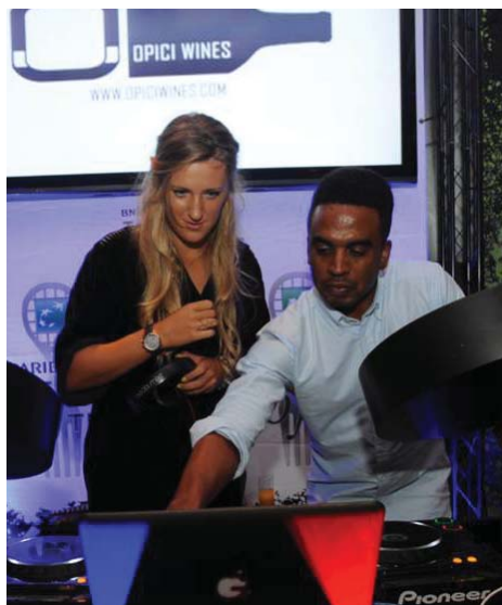
#2 Ranked Tennis Pro Victoria Azarenka Spinning at the Opici Wines DJ Booth

Serena Williams and her fellow tennis pros, as well as enthusiasts sipped on Sauska Villanyi Rose, Alverdi Pinot Grigio, Altadonna Grillo, Julia James Pinot Noir, and Carpineto Spolverino at the BNP Paribas Taste of Tennis at the W Hotel in New York.